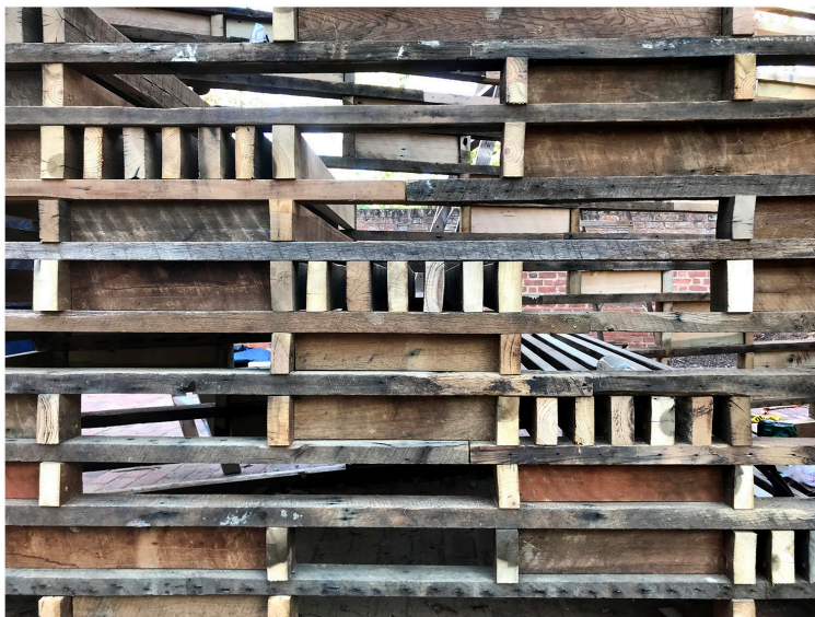
Wall stacking detail of reclaimed members