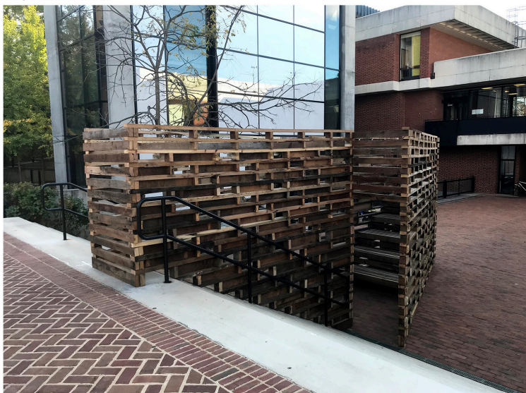
Building Tolerance Pavilion from upper terrace

The Building Tolerance Pavilion is a site-specific installation constructed by 13 students during a month-long workshop. The temporary pavilion examines the role of tolerance in architecture and in society. The structure is made of irregular, reclaimed wood and is positioned to create a forum for discussion. The exercise enables students to develop techniques for material tolerance while creating a space for social tolerance.