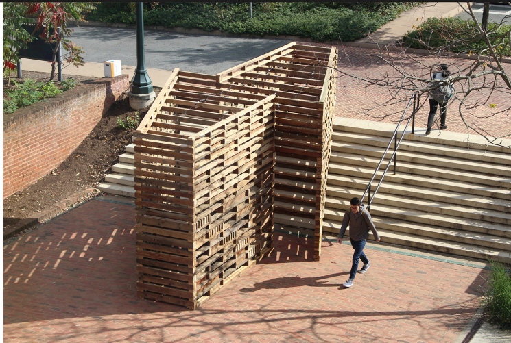
Building Tolerance Pavilion from above

Much of the finishes and details in a building are there for the purpose of hiding the gaps that exist at the intersections of materials and building elements (floors/walls/ceilings/roofs). Contemporary construction techniques often depend upon the layering of materials to accommodate material diversity. This allows for a layering of tolerances and precision as well. The first layer (a frame) is rough, the second layer (sheathing) is more precise, and the third layer (finish) is highly exact. This project examines this condition of tolerance and precision. It asks, how does the architect control tolerance? How can the architect design tolerance? These questions will inform strategies for material, construction, program, form and space.